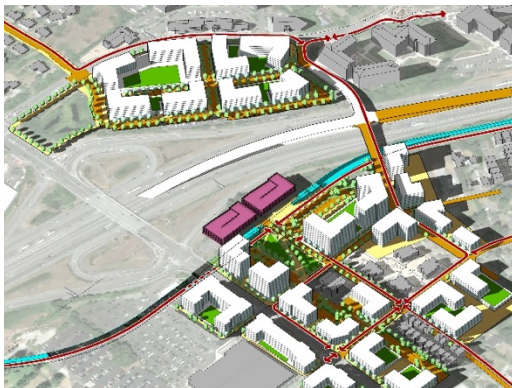
Community scale aerial views

The images below illustrate the types of graphics we are looking for and the types of projects we typically work on.