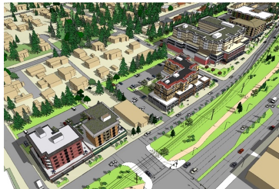
Project scale views