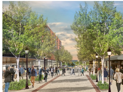
Public realm renderings