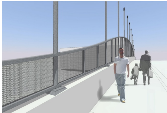
Urban design details